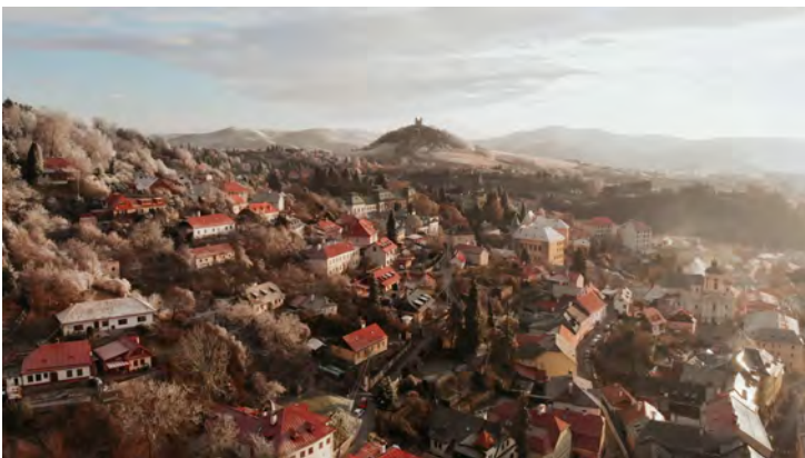
In this town in the heart of Supervolcano Štiavnica, world's longest love poem was born from true love story of Marína and Sládkovič. Banská Štiavnica is the town of UNESCO world heritage.

"It cannot be just a coincidence that the world's longest love poem (also registered as a world record at the World Record Academy) was born out of great love right in the heart of a supervolcano, in the picturesque town of Banská Štiavnica. I would like to invite people from around the globe to visit us and see the authentic places that gave birth to wonderful love verses. I think that everyone who believes in love should come to the heart of the Supervolcano Štiavnica at least once in their lifetime - to visit the house where Marína lived, walk around her familiar places and experience first-hand the eruption of passion and romance as did Marína and Sládkovič in the mid-19 th century."