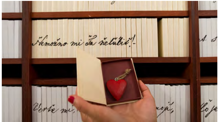
The only Love Vault is made up of 2,900 verses of the world's longest love poem. In the verses there are 100 000 Love Boxes. In these, people from different parts of the world keep symbols of their love and happiness.