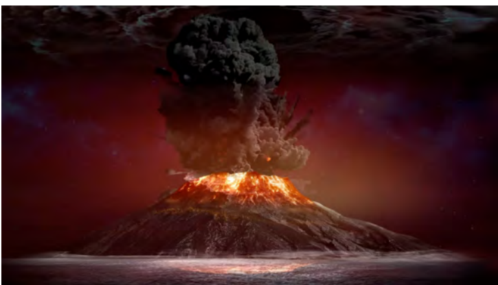
15 million years ago, a Supervolcano Štiavnica that you have never heard of erupted on our planet.

According to CNN; this super volcano, once one of the greatest threats on the planet, had transformed into: "An enchanting and breath-taking UNESCO destination, hidden deep in the forests, offering tourists a globally unique experience."