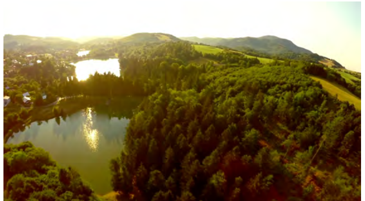
A new radical theory claims that this water engine is actually the world's first aqua park with an unlimited amount of geothermal supervolcanic water.

Download all high quality pictures and videos here: