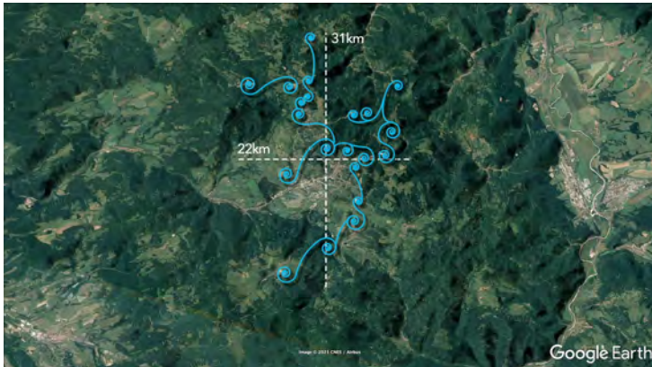
The world's biggest water engine mechanism is the ingenious system of dozens of lakes interconnected by hundreds of canals and thousands of underground tunnels.