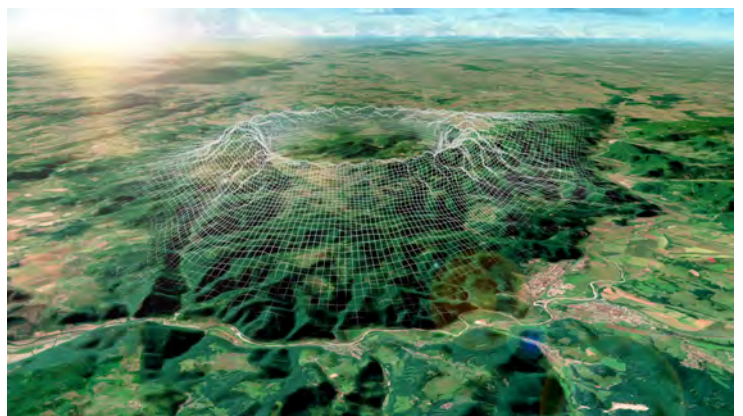
Discover the remains of gigantic Supervolcano Štiavnica - incredible, hidden destination in the middle of Europe, in the heart of Slovakia.

Download all high quality pictures and videos here: