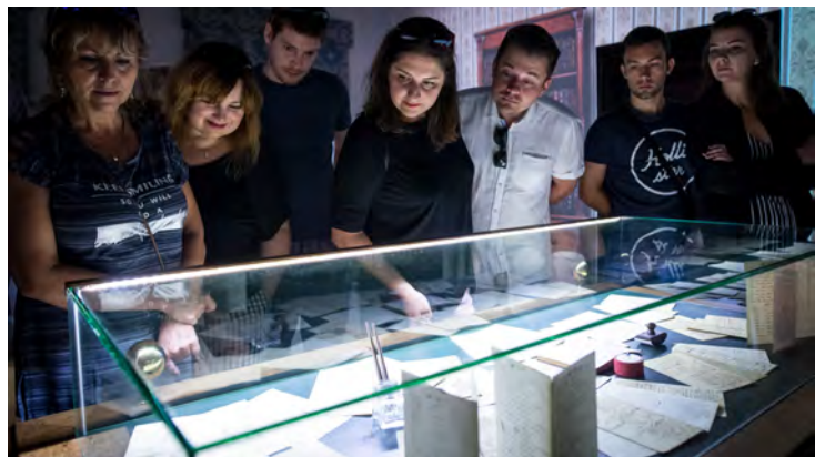
Manuscript of the love poem Marína from 1846 has survived to this day. The poem Marína has so far been published in more than 50 editions, in 8 world languages. It is world's longest love poem registered as an official world record at the World Record Academy.

Download all high quality pictures and videos here: https://bit.ly/3ecBdFb