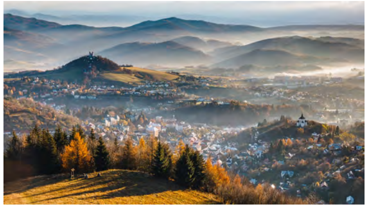
Right here at the Supervolcano Štiavnica - the Silicon Valley of the 18 th century, for the first time in history, scientists succeeded in extracting gold from rock.

Download all high quality pictures and videos here: https://bit.ly/3ecBdFb