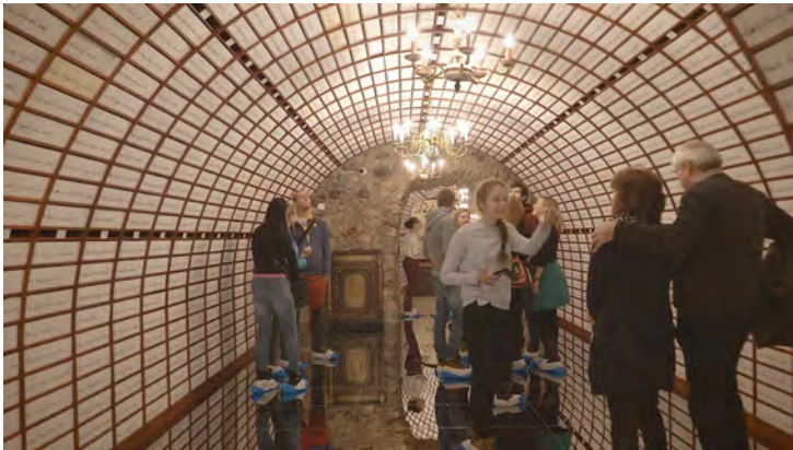
The only Love Vault in the world is located in the LOVE BANK, in the house where Marína lived, within its basement, in a former gold mine.

Another unique place you will discover in Banská Štiavnica is the LOVE BANK - experience house dedicated to the world's longest love poem. It is located in the house where Marína lived, within its basement, in a former gold mine. The main attraction of the LOVE BANK is the only Love Vault in the world. It is made up of 2,900 verses of the world's longest love poem. In the verses there are 100,000 Love Boxes. In these, people from different parts of the world keep symbols of their love and happiness. They believe that thanks to the magical power of the world's longest love poem, their love and happiness will last forever.